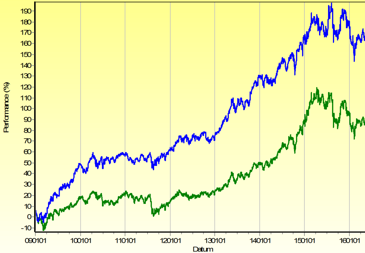
Acc GPS & Net Worth