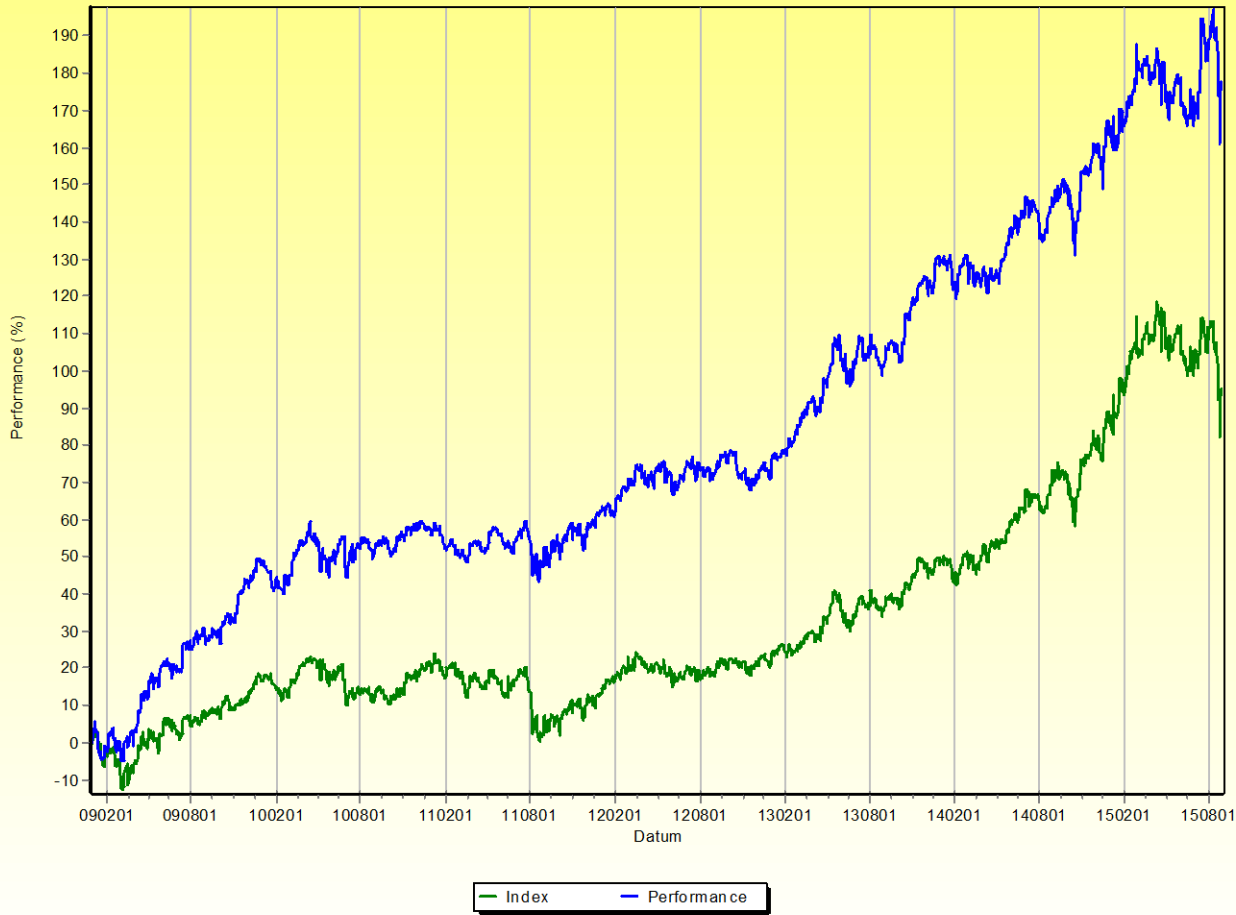
Acc GIPS & Net Worth